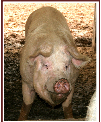
This is the snortin' part – Ms. Piggy always greets us with a smile at the rescue ranch!