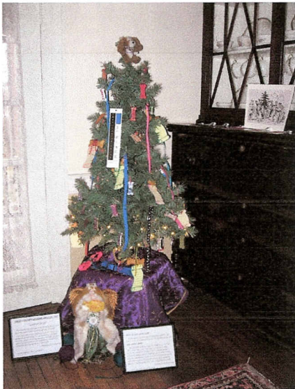
G.C.A.R. participated in the Festival of Trees at the Andrew Johnston House and won 1 st Place.